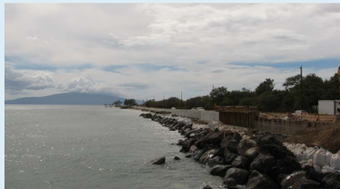
A seawall built in Ukumehame, Maui, to protect the shoreline and coastal infrastructure from erosion.

Sea level rise and the associated coastal impacts due to increased flooding, elevated ground water tables, storm surge, and erosion have the potential to harm an array of natural and built environments in Hawaii. Dying coral reefs add to this problem, as they leave the shoreline more vulnerable to erosion and damage from waves. In the Northwestern Hawaiian Islands Marine National Monument, sea level rise threatens native species, especially those that nest on beaches, such as green sea turtles, Hawaiian monk seals, and the endangered Laysan finch. Damage to coastal infrastructure may also hurt Hawaii's economy, more than a quarter of which stems from tourism. Waikīki Beach alone brings in $2 billion per year in visitor spending. Furthermore, many of Hawaii's native communities are in vulnerable coastal areas. Sea level rise and associated flooding are expected to destroy land, coastal artifacts, and structures of significant cultural value, and may force these communities to relocate.