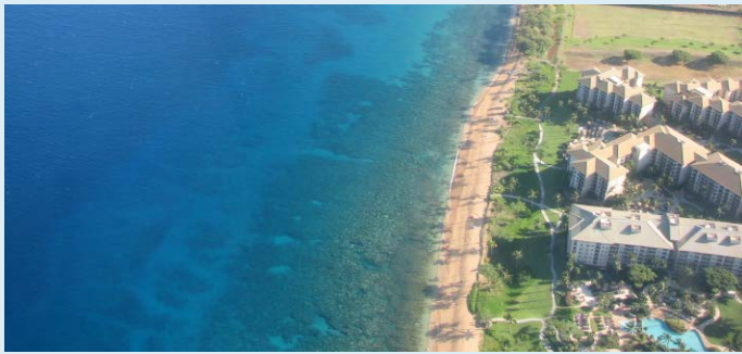
Tourism infrastructure and nearshore coral reefs, both threatened by climate change, in Maui.

reef fish could lose their habitats by 2100. Reefs also protect nearshore fish nurseries and feeding grounds. Damage to coral and reduced fish populations could negatively impact the state's economy, as these natural resources bring an estimated $385 million to Hawaii each year through tourism, direct consumption, and commercial fisheries.