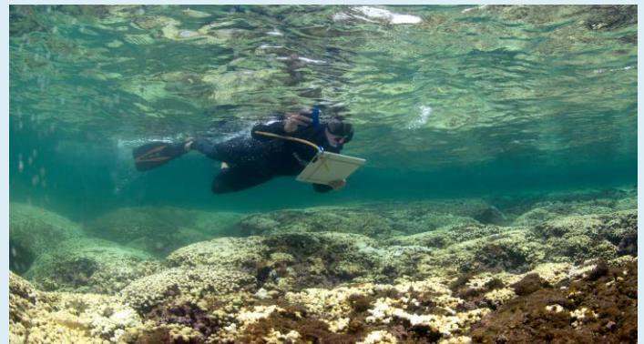
Bleached corals in Kaneohe Bay, Oahu, in the fall of 2014.

The waters around Hawaii are warming, which is harming Hawaii's coral reefs and marine ecosystems. The El Niño-Southern Oscillation ("El Niño") and other natural cycles cause ocean temperatures in the Pacific to fluctuate from year to year and from decade to decade. Even after accounting for these natural patterns, the waters around Hawaii have been warming since the 1950s, with temperatures rising by several degrees from the ocean surface down to at least 600 feet. Rising water temperatures can harm the algae that live inside corals. Because algae provide food for the coral, a loss of algae weakens corals and can eventually kill them. This process is commonly known as "coral bleaching," because the loss of the algae also causes the corals to turn white. Mass bleaching events are becoming more common, with documented cases in the north-western Hawaiian Islands in 1996 and 2002. Water temperature spikes in Hawaii have also been linked to coral disease outbreaks.